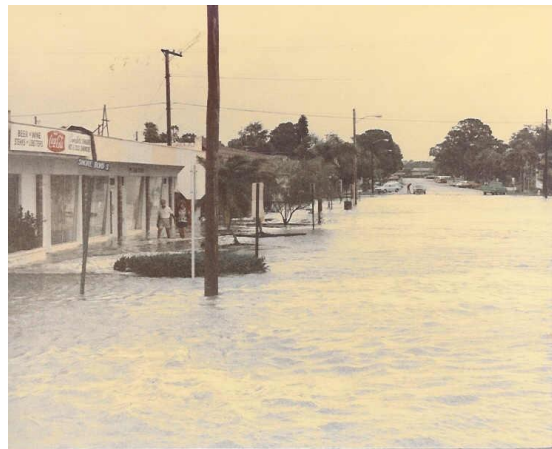
The above photo depicts historical flooding along Beach Boulevard in the City of Gulfport.

Many options are available for all residents to help prevent flooding and flood damage. You can start by reading and keeping this newsletter. Visit our Municipal Library located at 5501 28 th Avenue South, for additional information available to you. The City's Community Development Department can determine if you live in, or own property in a flood hazard zone. City staff can also discuss flood proofing options and review flood protection measures. If you have any questions on flood zones, or any other information provided in this newsletter, please contact the Community Development Department at 893-1000.